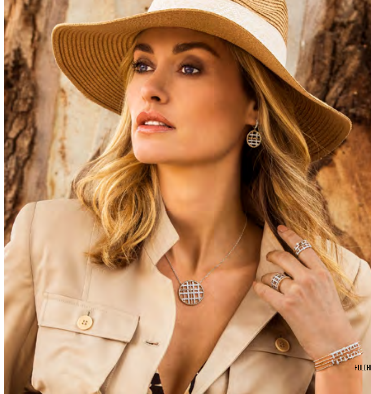
HULCHI BELLUNI. 9