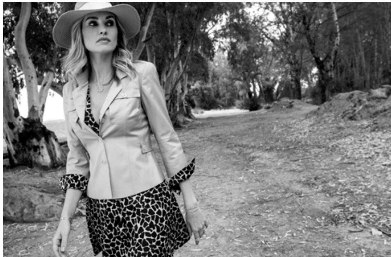
HULCHI BELLUNI. 8